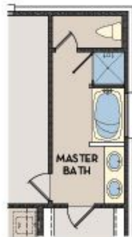
OPT. MASTER LUXURY BATH